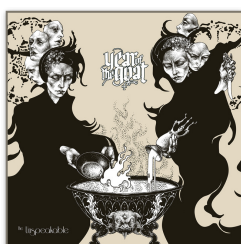
The Unspeakable (LP/CD 2015) Napalm Records