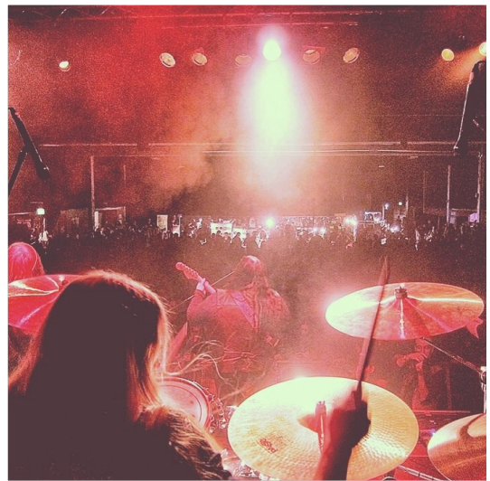
Live @Hammer of Doom

The follow up, "The Unspeakable" came in 2015 and was preceded by an EP as well. It to