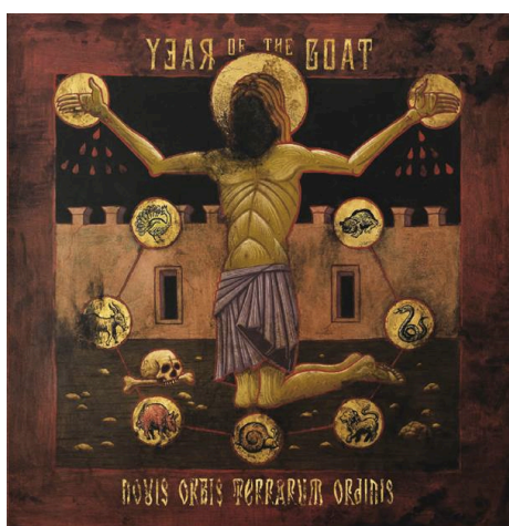
Novis Orbis Terrarum Ordinis (LP/LPCD 2019) Napalm Records

When what is regarded as good rears its true nature, when north turns to south and east turns to west, then it's all too clear where true evil really resides. Behind pious smiles and deep layers of self deception, thousands of years worth of pride, lust, greed, envy, gluttony, anger and sloth. After the violent departure of the Father, the path of the Son leads to his inevitable destiny, his throne of ice in the center of Dantes depiction of hell.