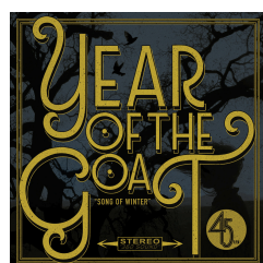
Song of Winter (Single 2016) Napalm Records