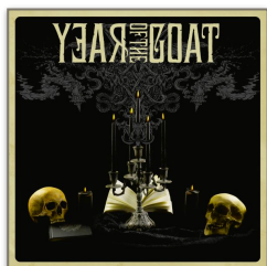
Lucem Ferre (EP/EPCD 2011) Vàn Records