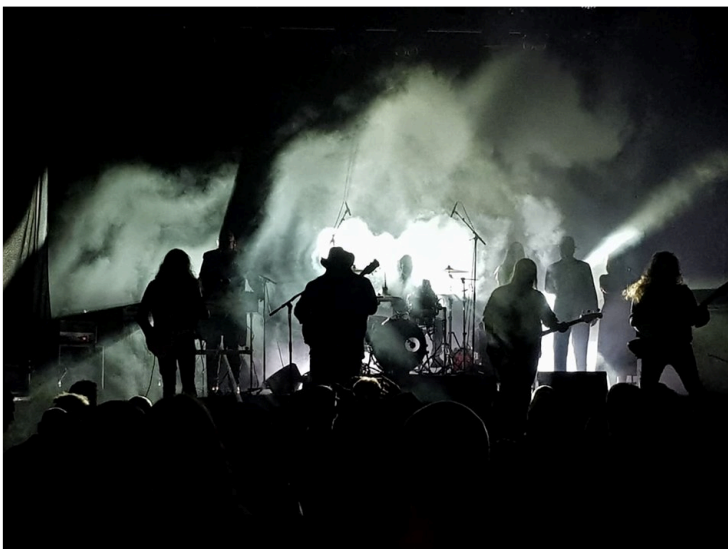
Album release show September 6th 2019 the six piece band with extra enforcements in three back up singers

It took a few years, but finally the third album is out there, and a damn fine one it is. Great reviews and high ratings across the board.