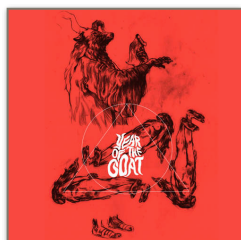
This Will Be Mine (Single 2012) Vàn Records