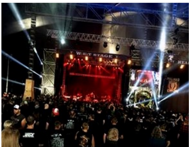
Live @Wacken Open Air

"A solid album from start to finish, it's easy to be caught up in the grasp of YEAR OF THE GOATS powerful playing, harnessing that darkly psychedelic edge to the fullest on Novis Orbis Terrarum Ordinis . Classic and nostalgic as ever, but so welcomingly fresh and entertaining, you'll embody a dark glory in every listen to this record." Distorted Sound