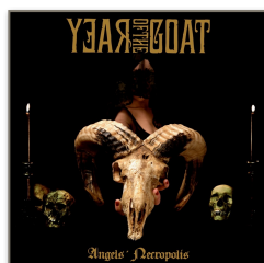
Angels' Necropolis (LP/LPCD 2012) Vàn Records